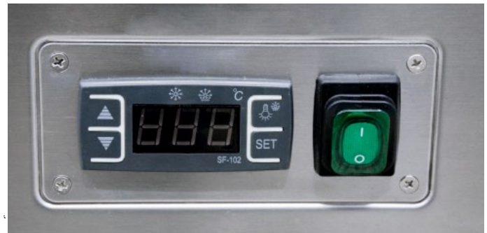
Digital temperature controller & display